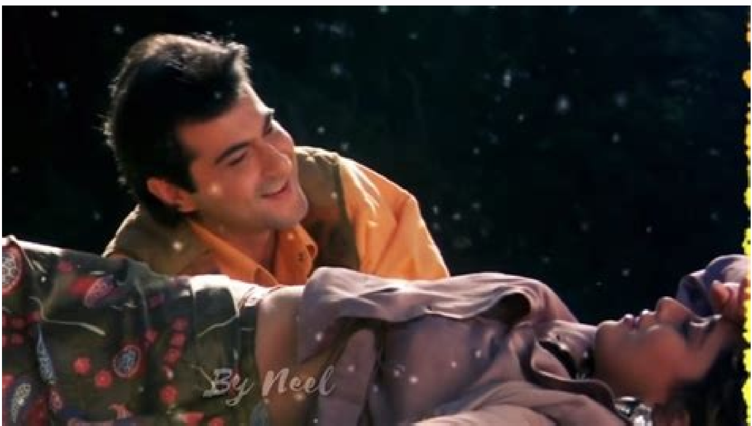
Kisi din banoongi main raja ki rani mp3 dj song. Kisi din banoongi main raja ki rani mp3 jhankar. Kisi din banoongi main raja ki rani mp3 ringtone download. Kisi din banoongi main raja ki rani mp3 dj.