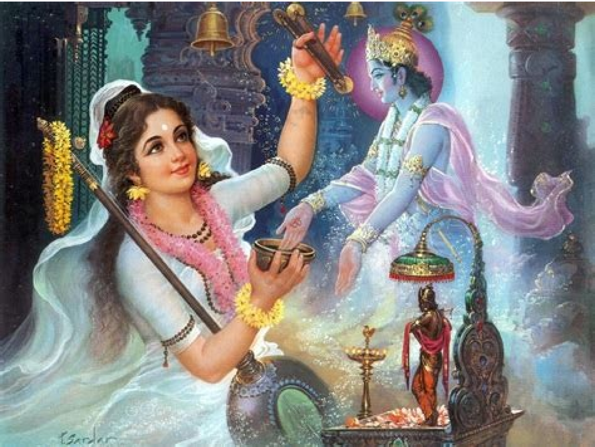
Krishna radha ke bhajan video. Krishna radha ke bhajan download. Krishna radha ke bhajan mp3. Krishna radha ke bhajan lyrics. Krishna radha ke bhajan sunao. Krishna radha ke bhajan video mein. Radha krishna ke bhajan sunaiye. Krishna radha ke bhajan sunaiye.