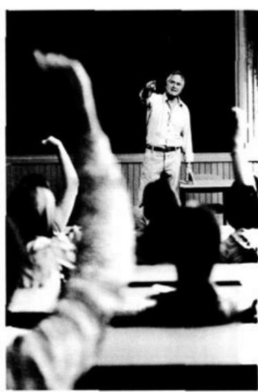
What steps can you take to get closer to becoming an actor/performer and a successful student?